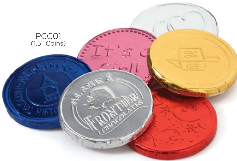
PCC01 (1.5" Coins)

MOST POPULAR STOCK DIES! (100's to choose from!)