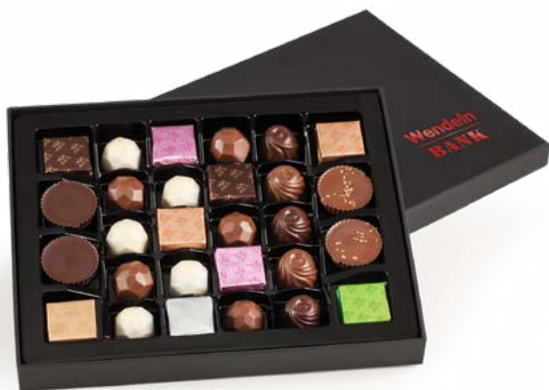
MC37 - Black/Black