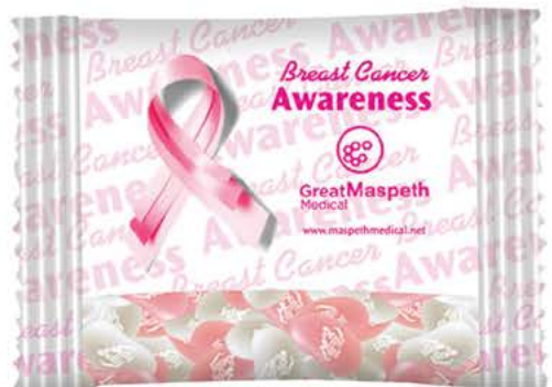
BREAST CANCER AWARENESS From our Stock Design Collection

EZ - PACKS Available in 5 stock colors with your choice of oval or rectangular window & white imprint. (up to 2 color logo imprint on white pack, setup charge will apply).