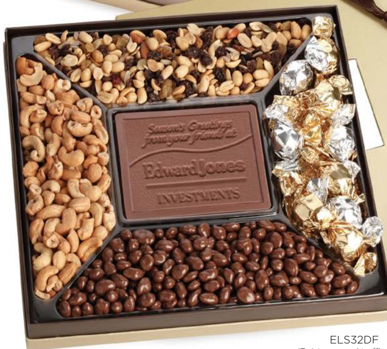
ELS32DF (Twist wrapped truffles only)