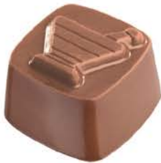
Mortar & Pestle