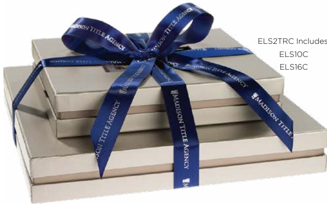
ELS2TRC Includes: ELS10C ELS16C

Window boxes in 2 & 3-tier options, filled with Belgian chocolate truffles showcasing a custom design, surrounding a Belgian chocolate centerpiece and finished with a hand-tied satin ribbon in choice of color. (See page 25 for truffle options)