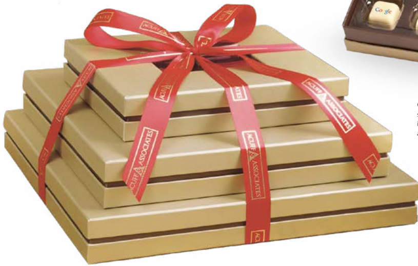
ELS3TR Includes: ELS10C ELS16C ELS32C