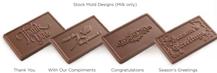
Stock Mold Designs (Milk only)

A delicious gift to help you connect with customers during sales meetings or presentations.