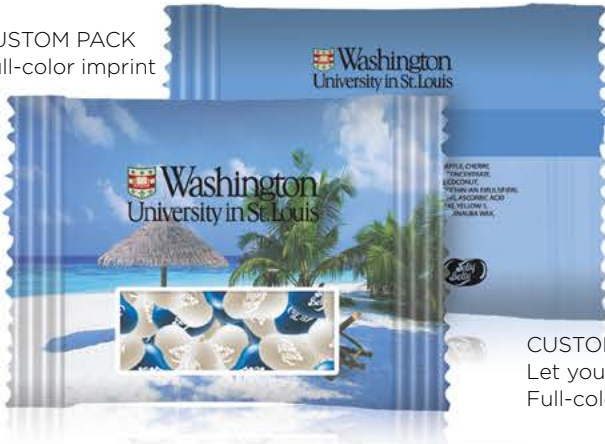
CUSTOM PACK Full-color imprint