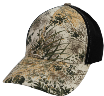
GAMEGUARD | CAVIAR FITTED | 5130GGC