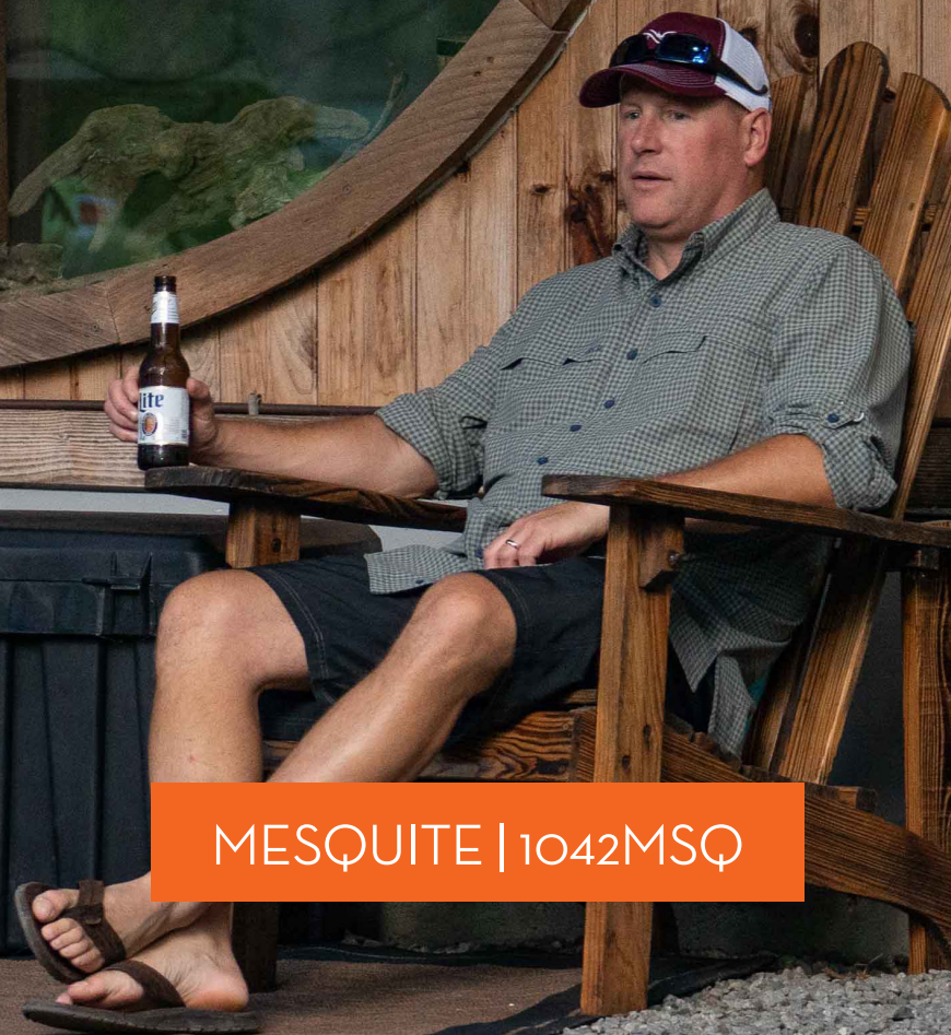
MESQUITE | 1042MSQ