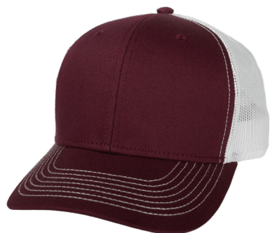
MAROON | WHITE MESHBACK | 5115MAR