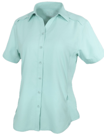
SEA GLASS | 1133SEA