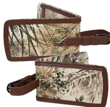
GAMEGUARD SIGNATURE LUGGAGE TAG | 2112GGC