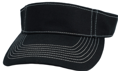
CAVIAR | 5017CAV