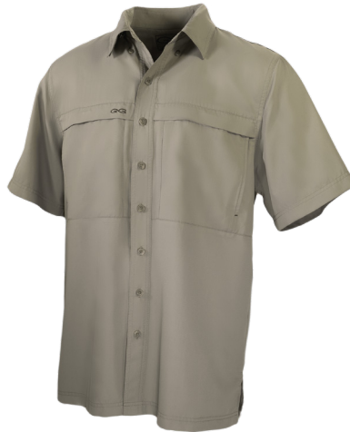
MESQUITE | 1023MSQ