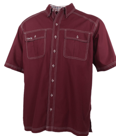
MAROON COTTON | 1818MAR