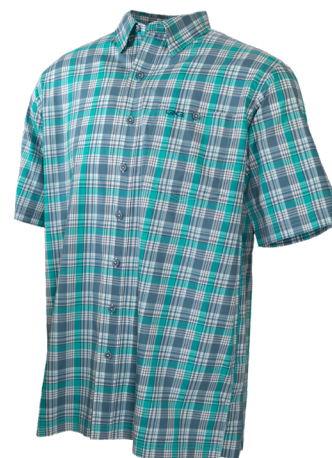
CARIBBEAN PLAID | 1718CRB