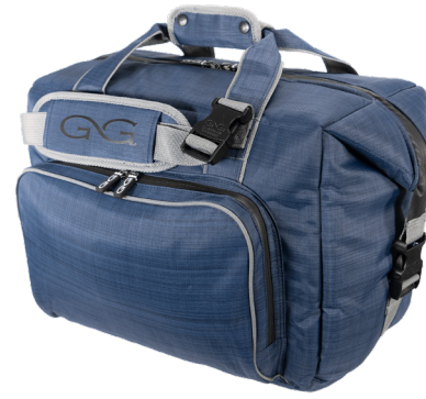
DENIM | 2048DNM