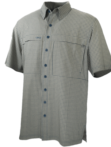
MESQUITE | 1041MSQ