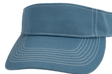
SLATE | 5017SLT