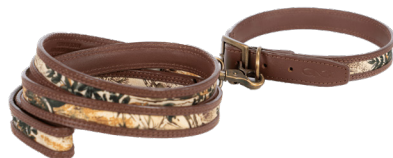
GAMEGUARD SIGNATURE DOG LEASH | 2110GGC