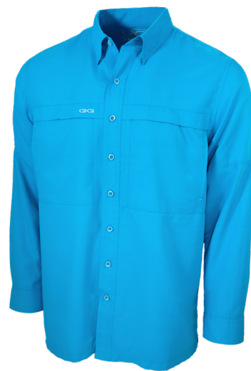
ATLANTIC | 1024ATL