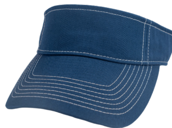
DEEP WATER | 5067DPW