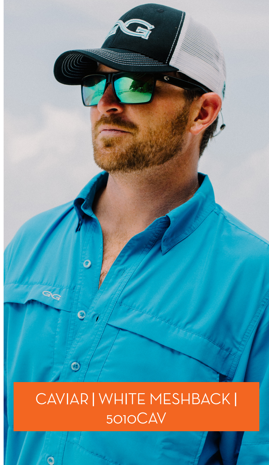
CAVIAR | WHITE MESHBACK | 5010CAV