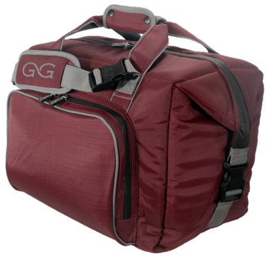
MAROON | 2048MAR