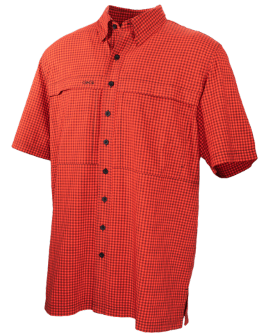
RED | 1041RED