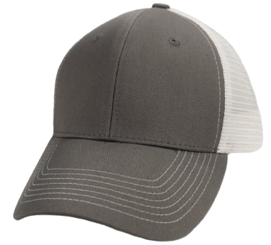
GUNMETAL | WHITE MESHBACK | 5015GUN