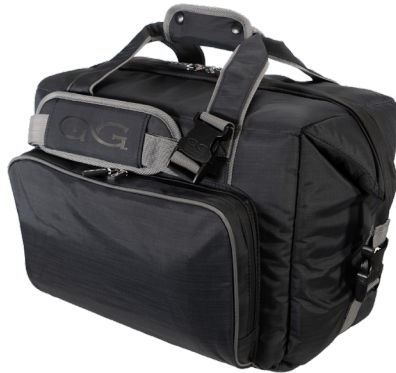
CAVIAR | 2048CAV