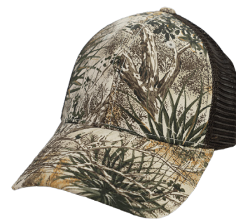
GAMEGUARD | CHOCOLATE MESHBACK | SNAPBACK 5022GGC