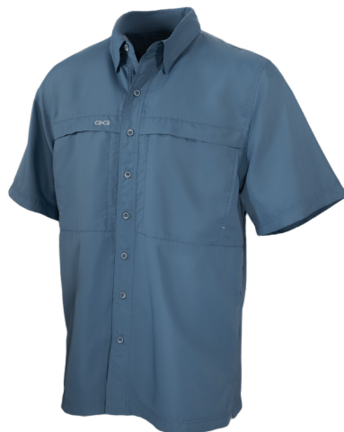
SLATE | 1023SLT