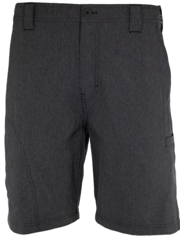
GRAPHITE | 3011GRA