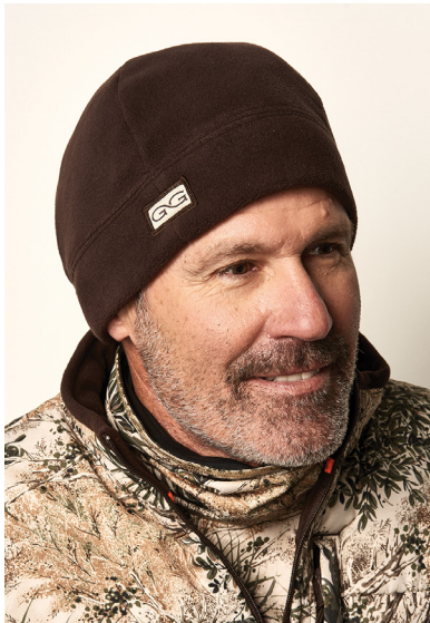
TOBOGGAN | 4217CHO

Don't forget about our GameGuard Outerwear essentials. Head out in head-to-toe GameGuard by adding our GameGuard Outfitter Gloves and Toboggan to your packing list. Not only will you be warm, but you'll also be protecting yourself from the elements.