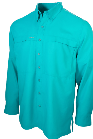
CARIBBEAN | 1024CRB