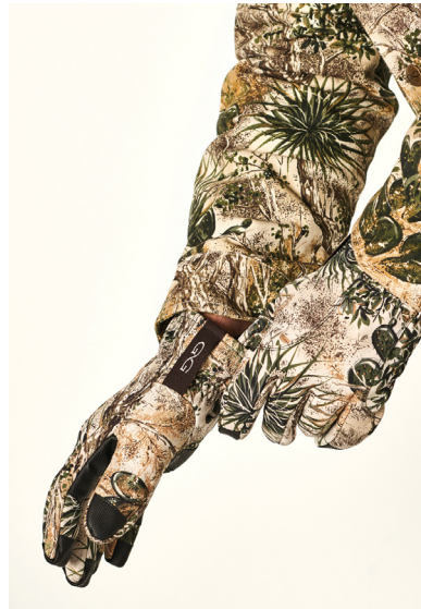
GAMEGUARD OUTFITTER GLOVES | 4208GGC