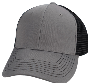
GUNMETAL | CAVIAR MESHBACK | 5021GUN