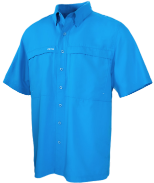
ATLANTIC | 1223ATL

We are big believers in teaching the next generation all about how to be good stewards of the outdoor world. Made with the same fabrics and performance features as our Men's MicroFiber shirt, our Youth MicroFiber shirt is perfect for your mini-me trips to the ranch where you teach them how to fire a rifle for the first time or tag their first trophy.