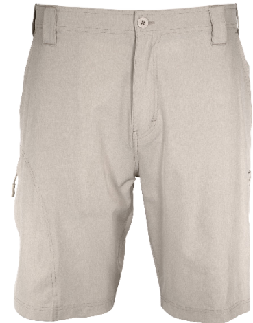
STONE | 3011STN