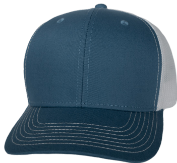
SLATE | WHITE MESHBACK | 5115SLT