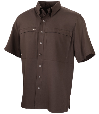
CHOCOLATE | 1023CHO