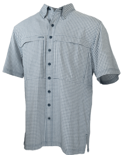
GLACIER | 1041GLC