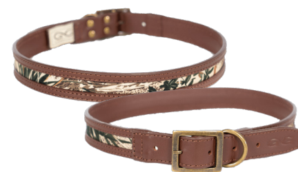
GAMEGUARD SIGNATURE YOUTH BELT | 2119GGC