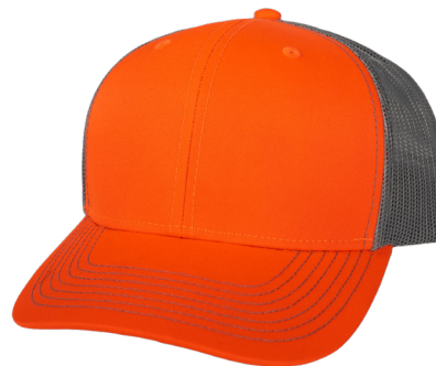
BLAZE | GLACIER MESHBACK | 5119BLZ