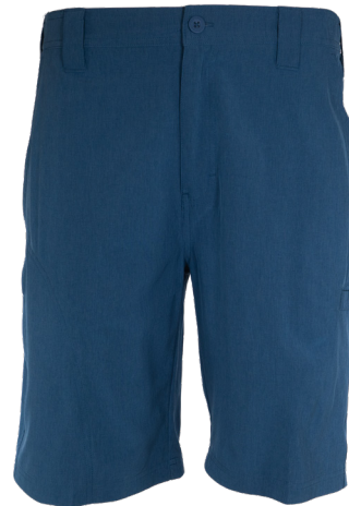
MARLIN | 3011MRL