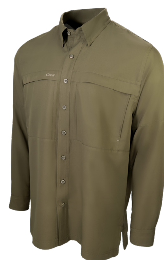
OLIVE | 1024OLV