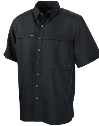
CAVIAR | 1023CAV