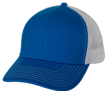
ATLANTIC | WHITE MESHBACK | 5115ATL