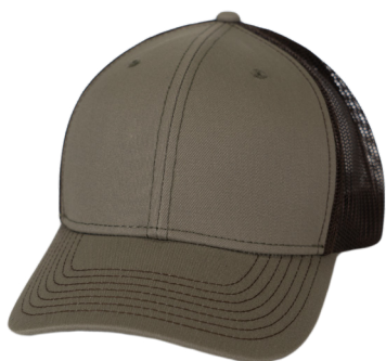
MESQUITE | CHOCOLATE MESHBACK | 5122MSQ