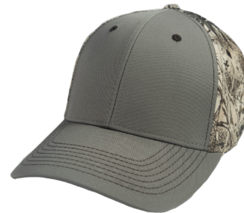
MESQUITE | GAMEGUARD HOOK & LOOP | 5040MSQ