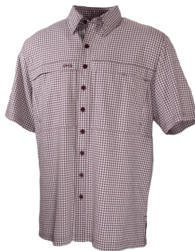
MAROON | 1041MAR