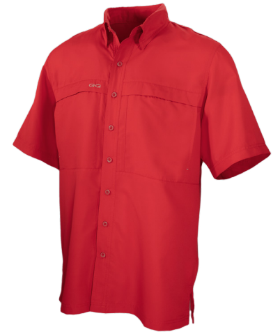
RED | 1023RED