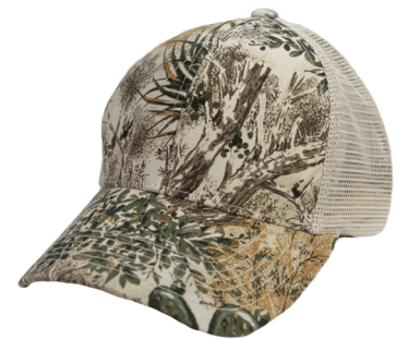
GAMEGUARD | STONE MESHBACK | SNAPBACK 5025GGC