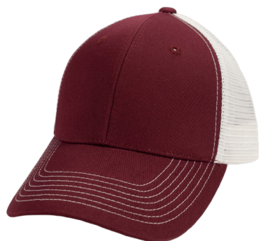
MAROON | WHITE MESHBACK | 5015MAR