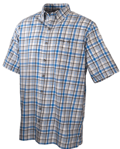
PACIFIC BLUE PLAID | 1718PBL