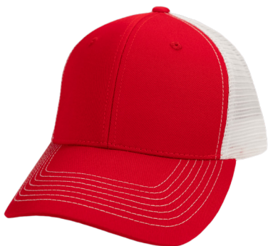
RED | WHITE MESHBACK | 5015RED