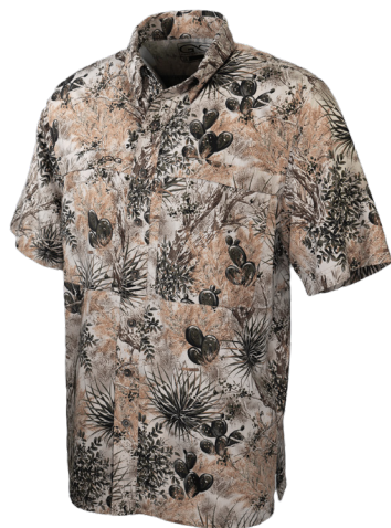
GAMEGUARD | 1023GGC