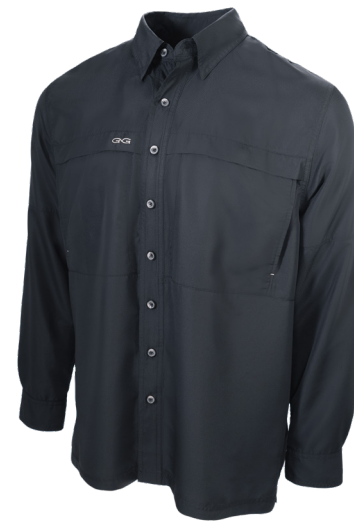
CAVIAR | 1024CAV