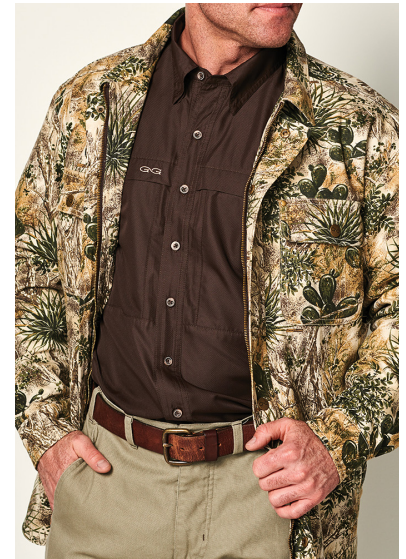
GAMEGUARD CANVAS JACKET | 4011GGC