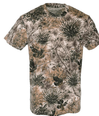
GAMEGUARD YOUTH TEE 1209GGC