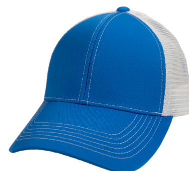
PACIFIC BLUE | WHITE MESHBACK | 5010PCB