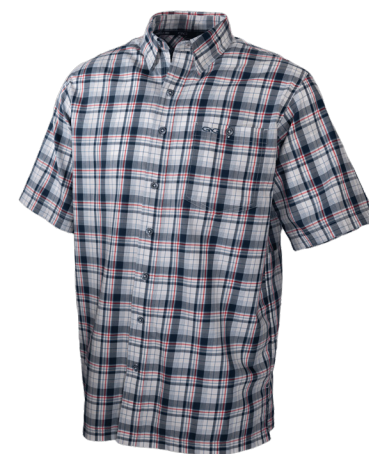
DEEP WATER PLAID | 1718DPW