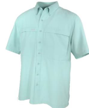
SEA GLASS | 1223SEA