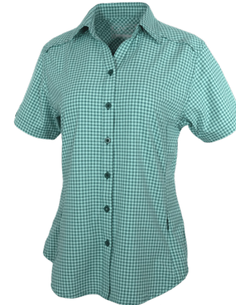
SEA GLASS | 1141SEA