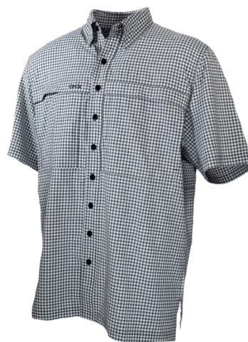
WHITE | 1041WHT