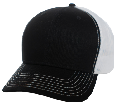
CAVIAR | WHITE MESHBACK | 5115CAV