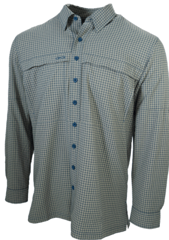
MESQUITE | 1042MSQ