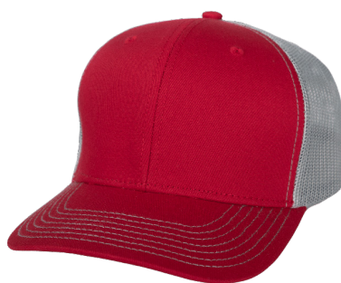
RED | GLACIER MESHBACK | 5119RED