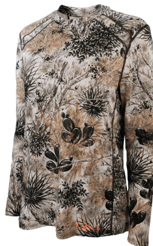
GAMEGUARD | 1128GGC