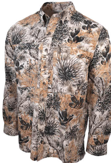
GAMEGUARD | 1024GGC