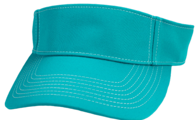
CARIBBEAN | 5017CRB