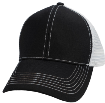
CAVIAR | WHITE MESHBACK | 5010CAV