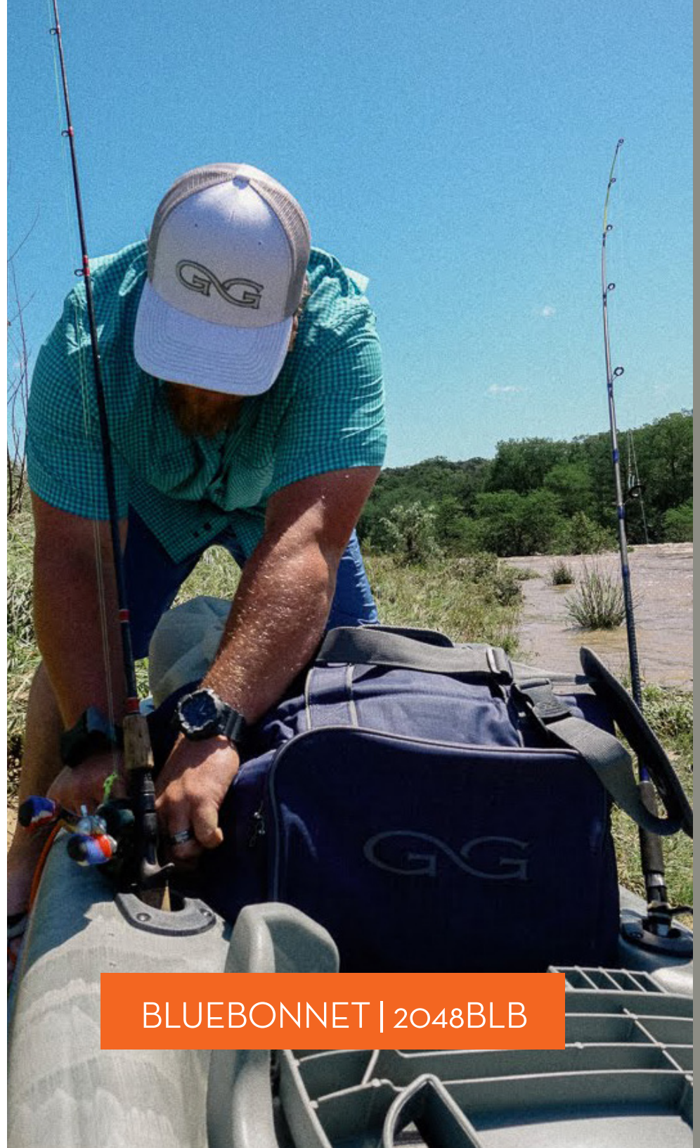
BLUEBONNET | 2048BLB