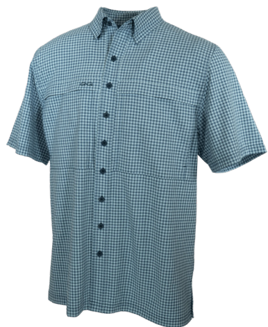
SEA GLASS | 1041SEA