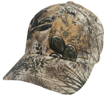
GAMEGUARD HOOK & LOOP | 5053GGC