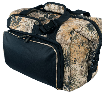
GAMEGUARD | CAVIAR 2001CAV