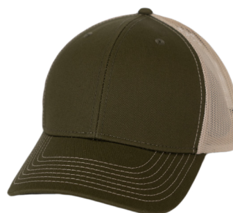
OLIVE | STONE MESHBACK | 5125OLV