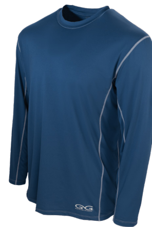
DEEP WATER | 1028DPW