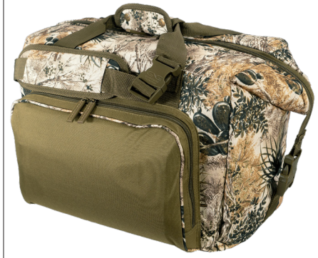
GAMEGUARD | OLIVE 2001OLV