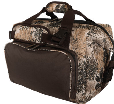
GAMEGUARD | CHOCOLATE 2001CHO