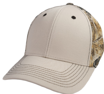
STONE | GAMEGUARD HOOK & LOOP | 5040STN