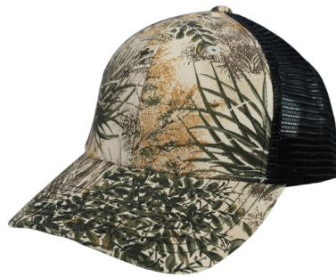
GAMEGUARD | CAVIAR MESHBACK | SNAPBACK 5021GGC