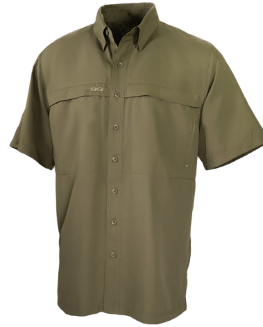
OLIVE | 1023OLV