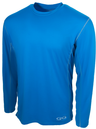
ATLANTIC | 1028ATL