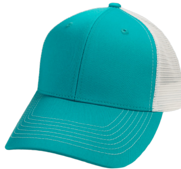
CARIBBEAN | WHITE MESHBACK | 5015CRB