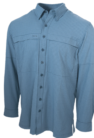
SLATE | 1042SLT