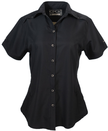
CAVIAR | 1133CAV

We believe ladies should never have to sacrifice form for function which is why we made our Ladies' styles. We have constructed our Ladies' MicroFiber Shirt using the same performance fabric as our men's styles and feature vented front shoulders, a vented back and a tailored fit for a woman. Dress like a woman, play like a woman.