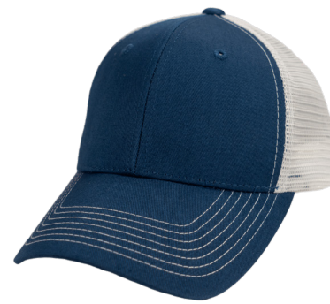
DEEP WATER | WHITE MESHBACK | 5015DPW