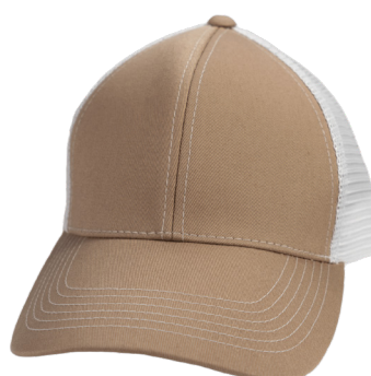
KHAKI | WHITE MESHBACK | 5010KHK