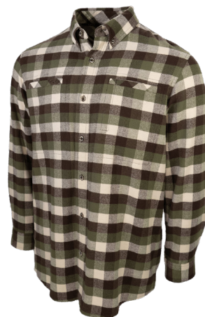
OLIVE FLANNEL 1043OLV