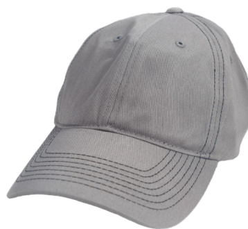
GUNMETAL | 5052GUN