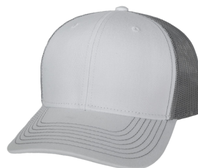
WHITE | GLACIER MESHBACK | 5119WHT