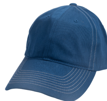
DEEP WATER | 5052DPW