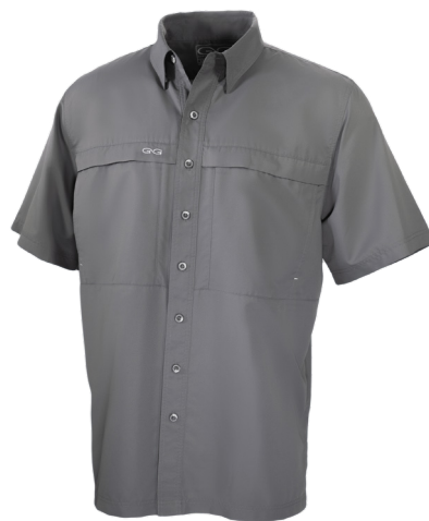
GUNMETAL | 1023GUN