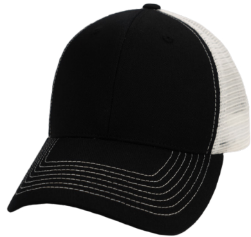
CAVIAR | WHITE MESHBACK | 5015CAV