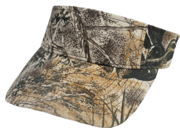
GAMEGUARD | 5067GGC