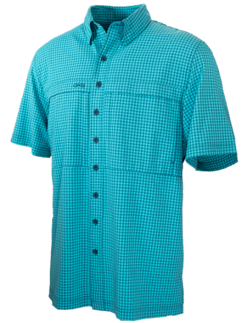
CARIBBEAN | 1041CRB