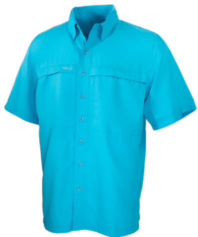
RIVER BLUE | 1023RVR