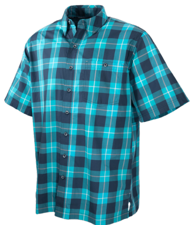
RIVER BLUE PLAID | 1719RVR