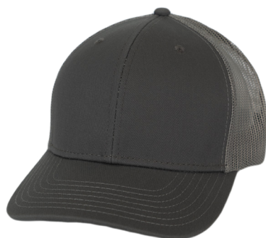
GUNMETAL | GLACIER MESHBACK | 5119GUN