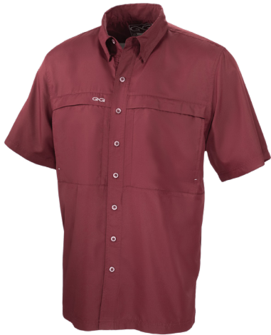
MAROON | 1023MAR