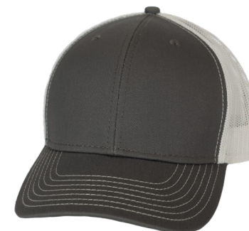
GUNMETAL | WHITE MESHBACK | 5115GUN