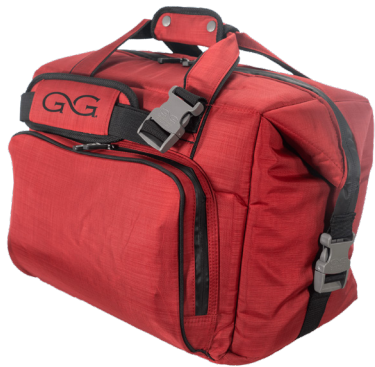
RED | 2048RED