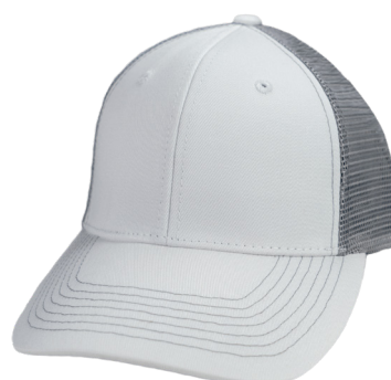
WHITE | GLACIER MESHBACK | 5019WHT