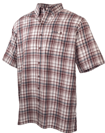
MAROON PLAID | 1718MAR