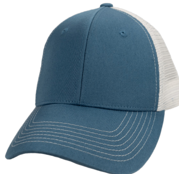
SLATE | WHITE MESHBACK | 5015SLT