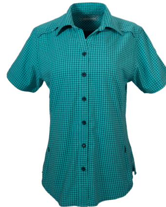
CARIBBEAN | 1141CRB

Ladies, we couldn't let you miss out on this classic comfort and stretch! For those who need a little more flex in their day, try our Ladies' TekCheck. Built with the same favored features as our TekCheck, our Ladies' TekCheck comes with a tailored fit to make any outfit.