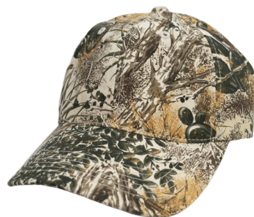
GAMEGUARD UNSTRUCTURED | BUCKLE & STRAP | 5004GGC