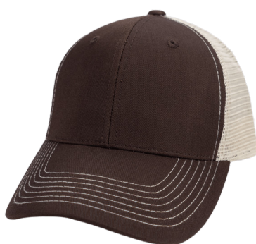
CHOCOLATE | STONE MESHBACK | 5025CHO