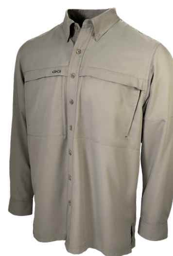
MESQUITE | 1024MSQ