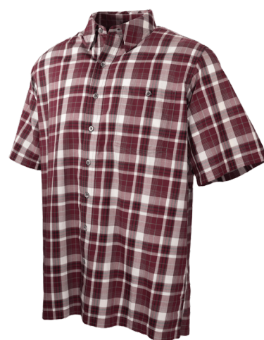
MAROON PLAID | 1719MAR