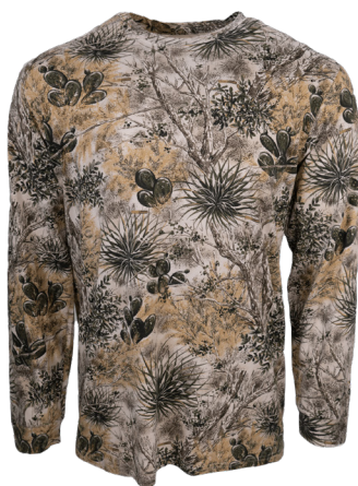
GAMEGUARD TEE LONG SLEEVE | 1010GGC