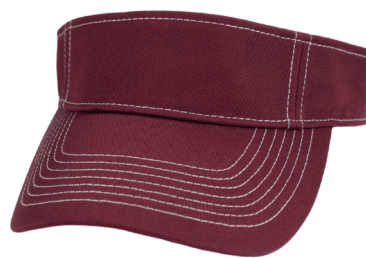
MAROON | 5017MAR