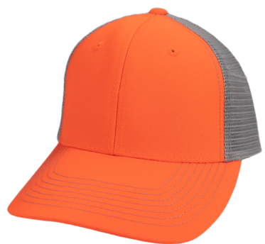
BLAZE | GLACIER MESHBACK | 5019BLZ