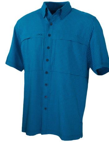
ATLANTIC | 1041ATL