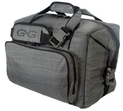
GUNMETAL | 2048GUN