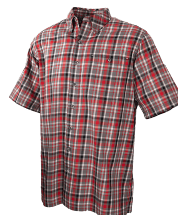
RED PLAID | 1719RED