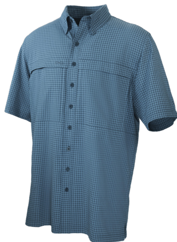
SLATE | 1041SLT