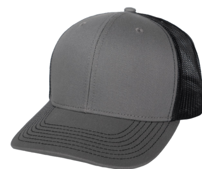
GUNMETAL | CAVIAR MESHBACK | 5121GUN