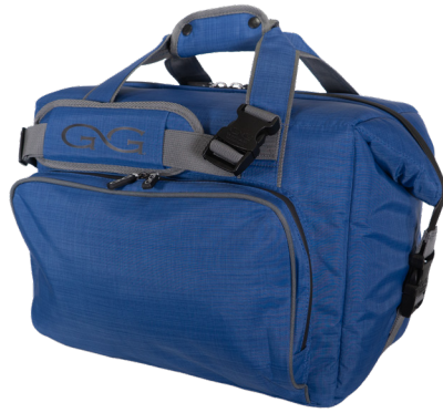
BLUEBONNET | 2048BLB