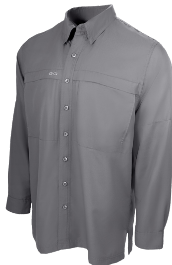
GUNMETAL | 1024GUN