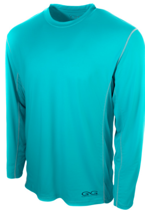
CARIBBEAN | 1028CRB