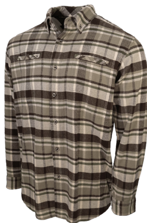
MESQUITE FLANNEL 1043MSQ