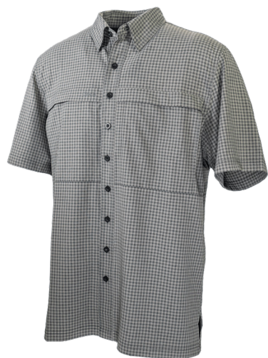
GUNMETAL | 1041GUN