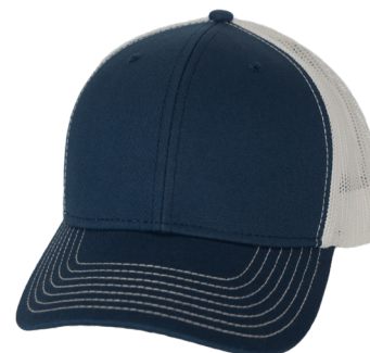
DEEP WATER | WHITE MESHBACK | 5115DPW