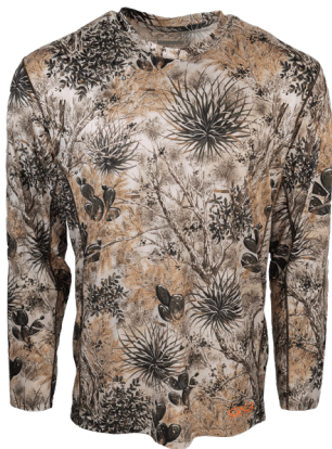
GAMEGUARD | 1028GGC