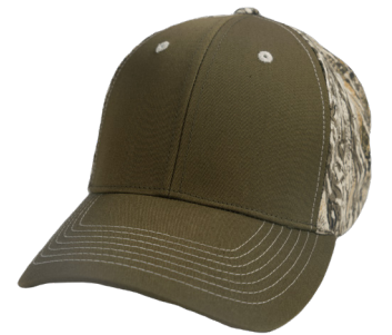
OLIVE | GAMEGUARD HOOK & LOOP | 5040OLV