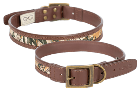
GAMEGUARD SIGNATURE DOG COLLAR | 2109GGC