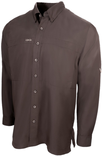
CHOCOLATE | 1024CHO