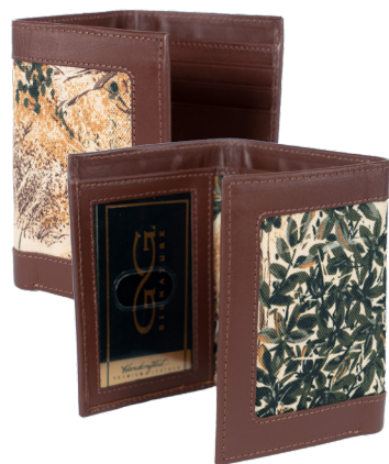
GAMEGUARD SIGNATURE TRIFOLD WALLET | 2101GGC