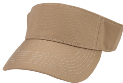
KHAKI | 5013KHK