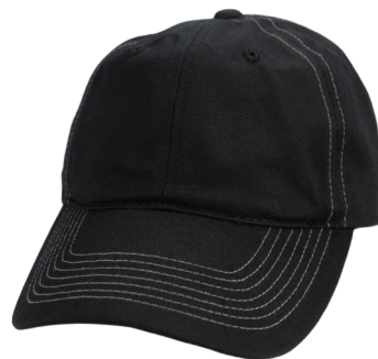
CAVIAR | 5052CAV