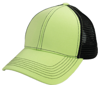
KEY LIME | CAVIAR MESHBACK | 5023KLM