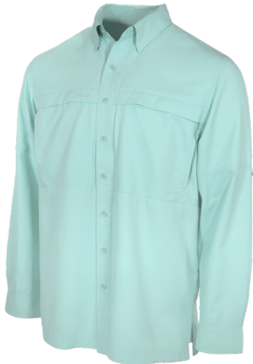
SEA GLASS | 1024SEA