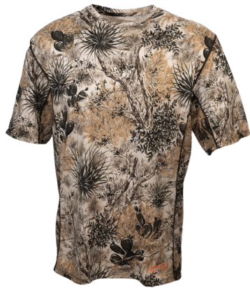
GAMEGUARD | 1056GGC