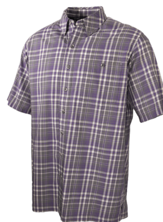
PURPLE PLAID | 1719PRP