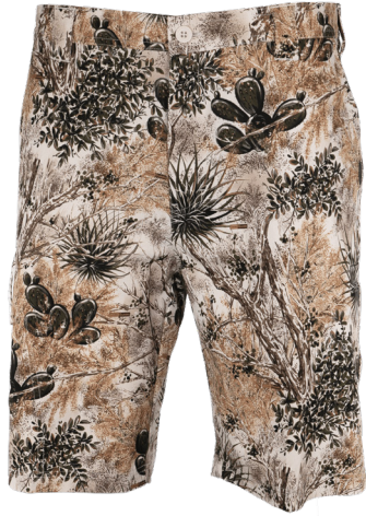
GAMEGUARD | 3001GGC