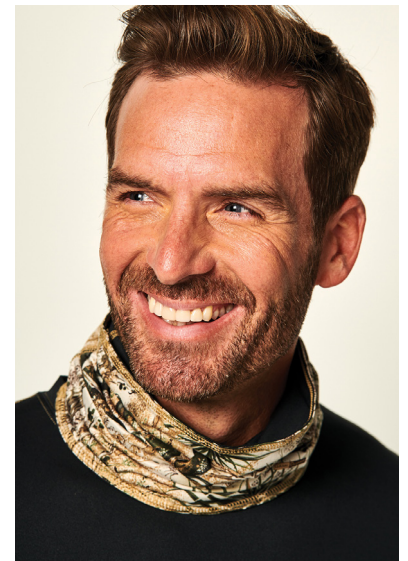
GAMEGUARD | CAVIAR REVERSIBLE | 4230GGC