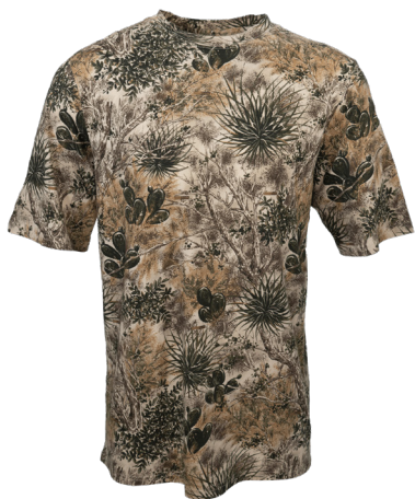
GAMEGUARD TEE 1009GGC

GameGuard cotton tees are made with 100% preshrunk cotton so they fit right every time. Try our short sleeve cotton tee for Dove Season and our long sleeve cotton tee in the winter months for year-round comfort and style. Also available in Youth.