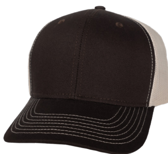
CHOCOLATE | STONE MESHBACK | 5125CHO