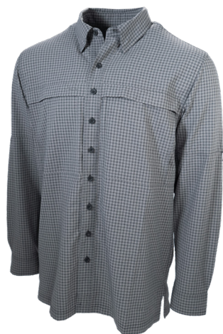
GUNMETAL | 1042GUN

For those chillier days, try our TekCheck Long Sleeve on for size. This classic will dominate your wardrobe all year long.