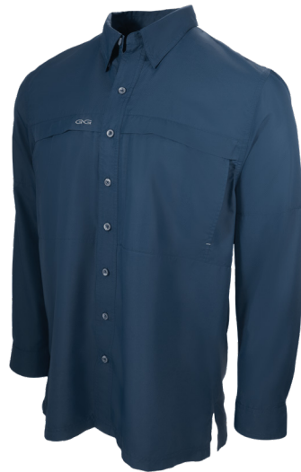
DEEP WATER | 1024DPW