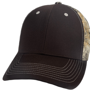
CHOCOLATE | GAMEGUARD | HOOK & LOOP | 5040CHO