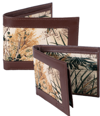
GAMEGUARD SIGNATURE BIFOLD WALLET | 2100GGC