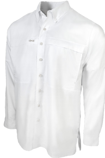
WHITE | 1024WHT