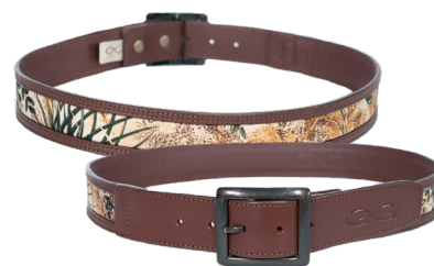
GAMEGUARD SIGNATURE BELT | 2103GGC