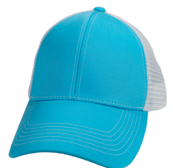
RIVER BLUE | WHITE MESHBACK | 5010RVR