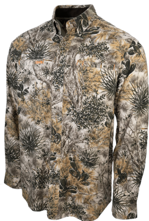
GAMEGUARD FLANNEL 1033GGC

Our Flannels will be your new winter uniform. Made with triple-brushed 100% cotton twill, these shirts will keep you warm and comfortable all winter long. Featuring two hidden welt pockets on the chest, a back yoke with inverted pleats for fuller range of motion and a dropped tail to stay tucked in, this shirt is along for the whatever adventure is thrown your way.