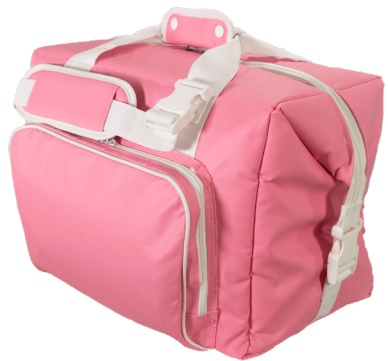
PEONY MARINE | 2014PEO