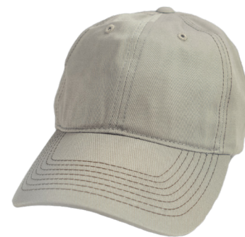
MESQUITE | 5052MSQ