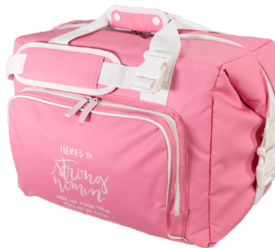
PEONY | STRONG WOMEN 2014PPEO