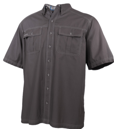
GUNMETAL COTTON 1818GUN