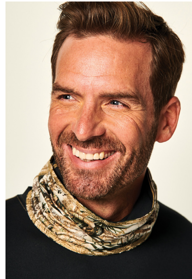
GAMEGUARD | CAVIAR REVERSIBLE | 4230GGC