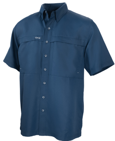
DEEP WATER | 1023DPW