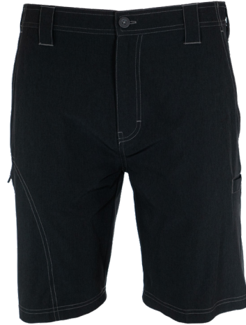
CHARCOAL | 3011CHR