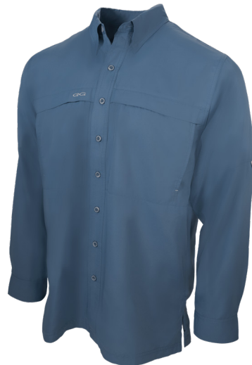
SLATE | 1024SLT