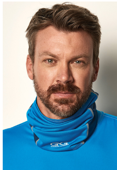
DEEP WATER | 4228DPW