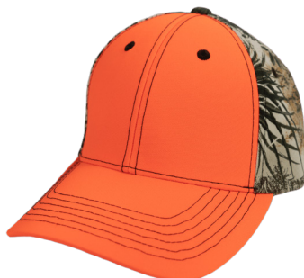
BLAZE | GAMEGUARD HOOK & LOOP | 5030BLZ