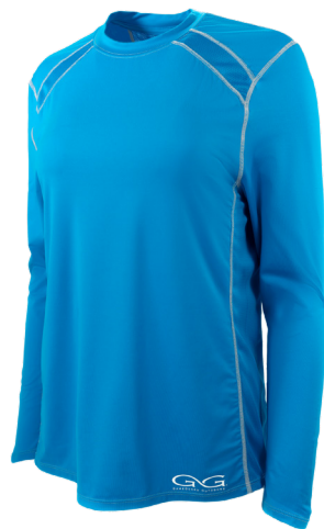
ATLANTIC | 1128ATL

By the pool with a glass of wine or out with your family fishing off the dock, the Ladies' Performance Tee is your all-purpose layering piece. Featuring the same moisture wicking and lightweight features as our classic Performance Tee, our Ladies' version has a tailored fit for a more flattering look.