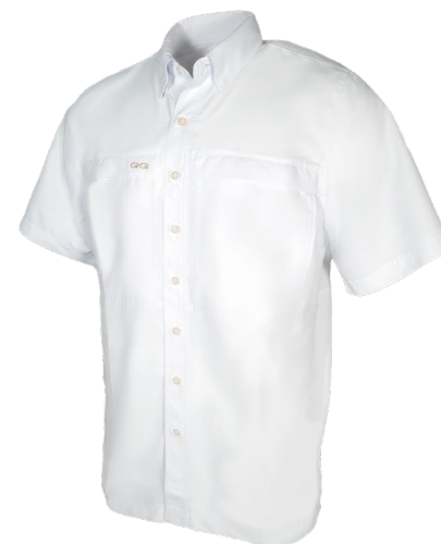
WHITE | 1023WHT