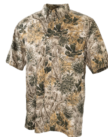
GAMEGUARD COTTON 1027GGC