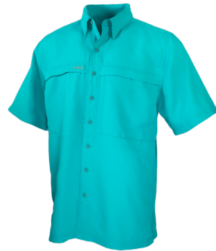
CARIBBEAN | 1223CRB