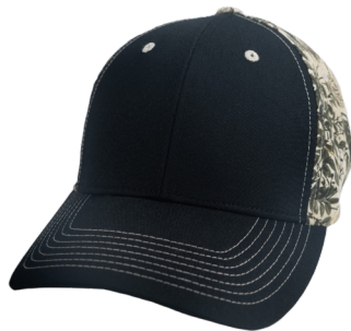
CAVIAR | GAMEGUARD HOOK & LOOP | 5040CAV