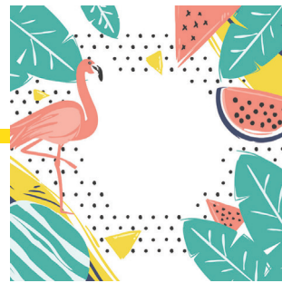
Tropic Like it's Hot