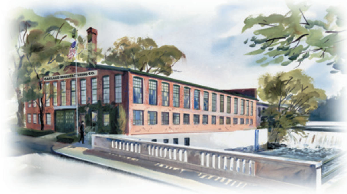
Garland Headquarters, Coventry, Rhode Island, USA