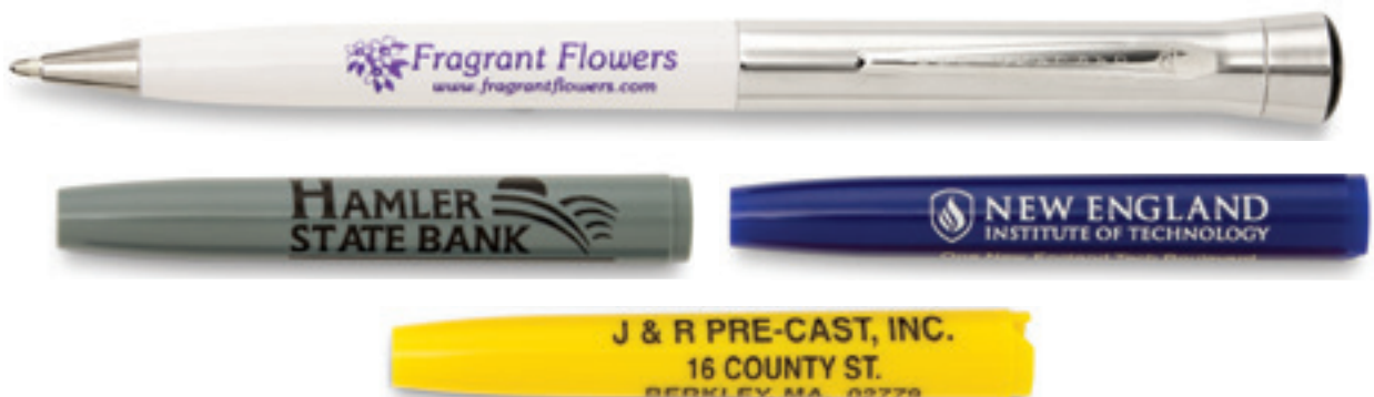
Imprinting – (Founder's Collection only) ~ Vivid and multi-color custom decoration