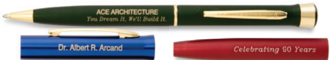
Standard Font Engraving – Traditional and clean