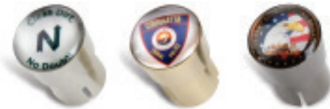
Photo Top Logo Custom Decoration