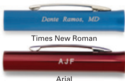
Times New Roman