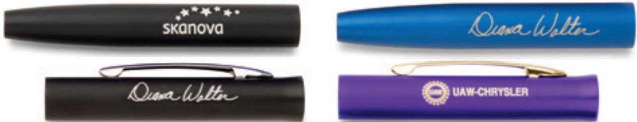
Laser Logo Engraving – Precise, high-quality custom decoration