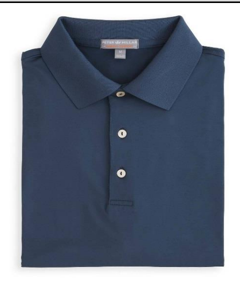
Color Shown: Midnight

Black, Midnight, Cottage Blue, White, Purple, Green, Red, Blue, Maroon